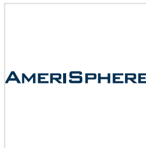
Omaha, NE Multifamily Mortgage Loans