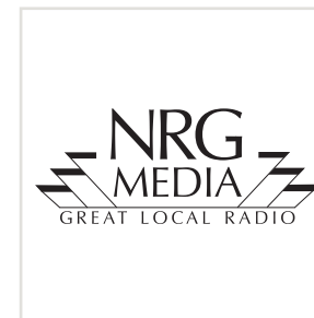
Cedar Rapids, IA Radio Operator