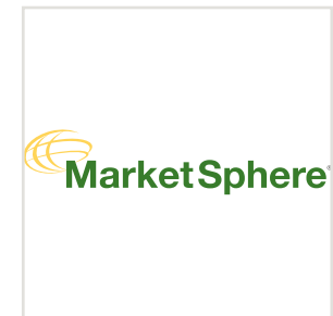
Omaha, NE Business Consulting