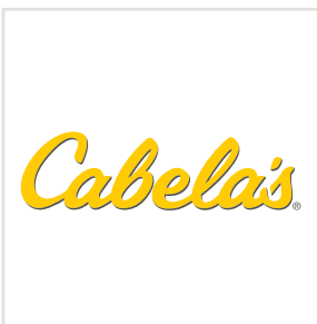
Sidney, NE Specialty Retailer