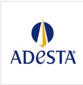
Omaha, NE Security Solutions